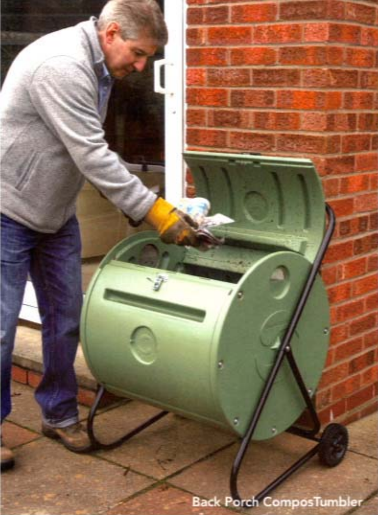
Back Porch ComposTumbler