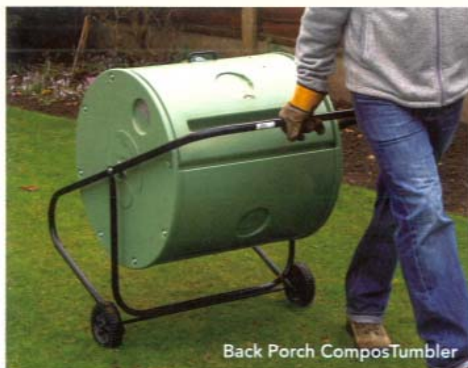
Back Porch ComposTumbler

Each batch of compost can take as little as 14 days to produce with most materials, instead of the months or even years required by most traditional methods.